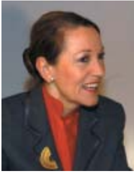
Dr. Benita Ferrero-Waldner Foreign Minister

I would like to extend a warm welcome all the participants of this year's conference of the International Vocational Education and Training Association in Vienna.