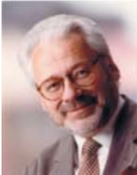
Dr. Erhard Busek Special Coordinator of the Stability Pact for South Eastern Europe

Southeast Europe has seen tremendous changes in the last years. In all countries, we have democratic governments and the economies are being transferred to market economies. Politically speaking, future membership in the EU is on the horizon. I am happy to note, that after the EU enlargement 1 May 2004, focus is shifting to Southeast Europe as the region for the next EU enlargement.