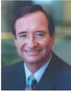
Dr. Christoph Leitl President – Austrian Federal Economic Chamber

As President of the Austrian Federal Economic Chamber, I am delighted to have the 2004 IVETA Conference here in our building. Our many important guests know that the importance of Vocational Education and Training is growing. The Austrian Federal Economic Chamber has always placed an emphasis on Vocational Education and Training and Further Education in its endeavours with and for the local enterprises and businesses.