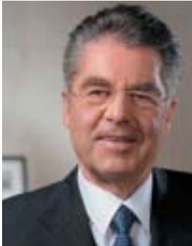
Dr. Heinz Fischer The Federal President of Austria

I sincerely welcome all the participants of the International Vocational Education and Training Conference 2004 to Vienna.