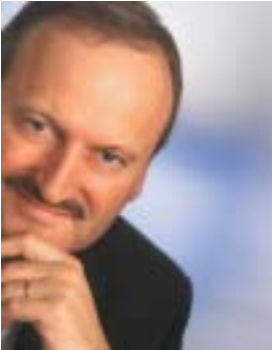
Hubert Gorbach Vice-Chancellor of Austria

As the Federal Minister for Transport, Innovation and Technology, I welcome all efforts aiming to showcase Austrian Know-How and Austrian technological competence to a broad audience. Education, in the widest possible sense, must include the acquisition of technological competence. Lifelong Learning must also be seen in the context of new technologies.