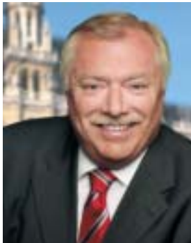
Dr. Michael Häupl Mayor of Vienna

... is, beyond any doubt, the most important “raw material“ of the 21st century. I am thinking here of the varied classical Viennese school education in particular, such as the Technical and Vocational Schools; Universities; Adult-Education Centres; Post-graduate Education; Professional Development in the workplace; and Life-long Learning Initiatives.