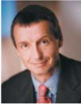
Dr. Martin Bartenstein Federal Minister for Economics and Labour

Investing in proper vocational education and training is an indispensable prerequisite to ensure a lifelong and personally satisfying career that permits individuals to cope with the manifold changes in production technologies and techniques, new forms of business organisation, and the constant development and application of new materials and services.