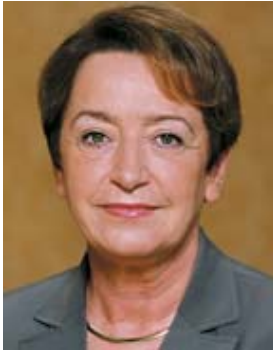
Elisabeth Gehrler Federal Minister for Education, Science and Culture

Solid vocational education and training provides young people with the best possible basis for a successful life. At the same time, the quality of initial vocational education and training is also one of the decisive factors of a region's economic performance.